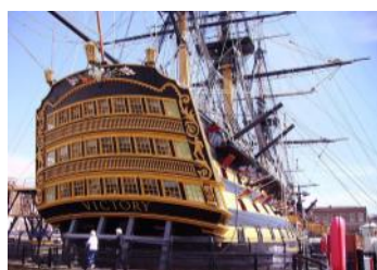
HMS Victory