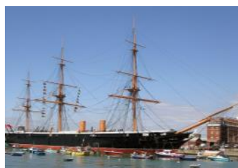
HMS Warrior