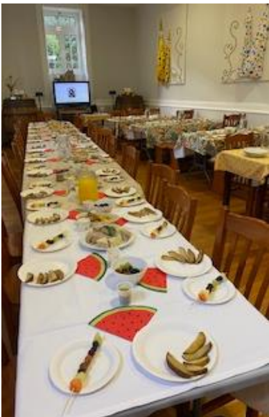
TV screen computer and seating for 45 at the diner table — a tight squeeze

Many thanks to those who helped especially moving furniture around.